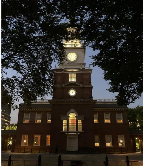
Independence Hall at dusk

October is a great time to book our popular one-hour tour, Revolting Philly!