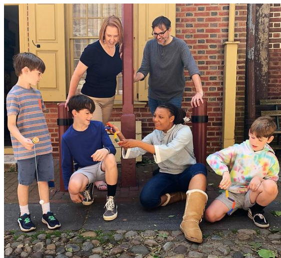
Family Fun walking tour shown in Elfreth's Alley, Philadelphia

The FAMILY FUN walking tour explores what life was like for families in the colonial era. Try your hand at colonial toys while you visit the most iconic sites in Philadelphia! This one-hour walking tour is a must-see for families and is appropriate for all ages. Click here for times and tickets.